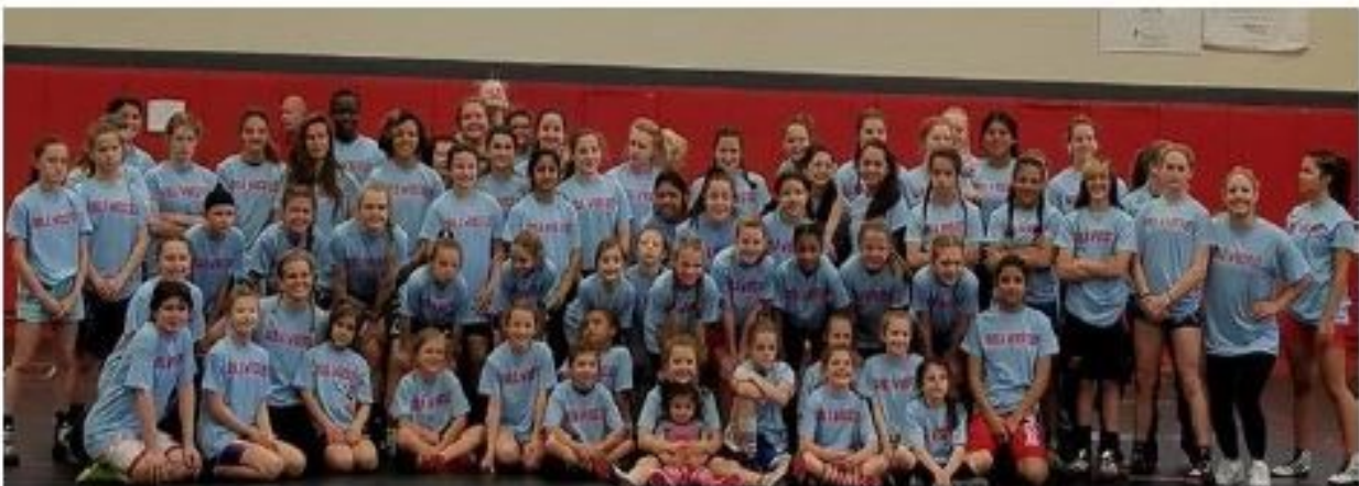
PIC OF 2018 DUALS WRESTLERS