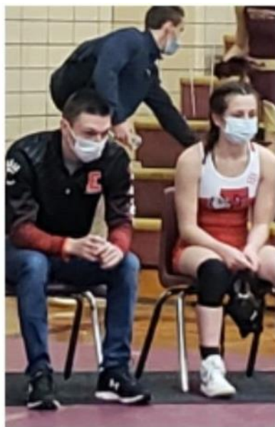
Picture: Girls Wrestling coaches from the five teams that attended the girls wrestling competition held at Governor Mifflin on January 23rd.